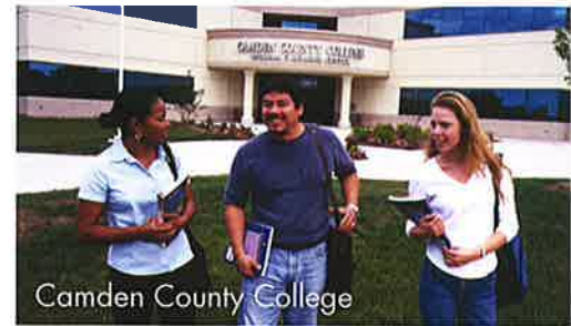
Camden County College